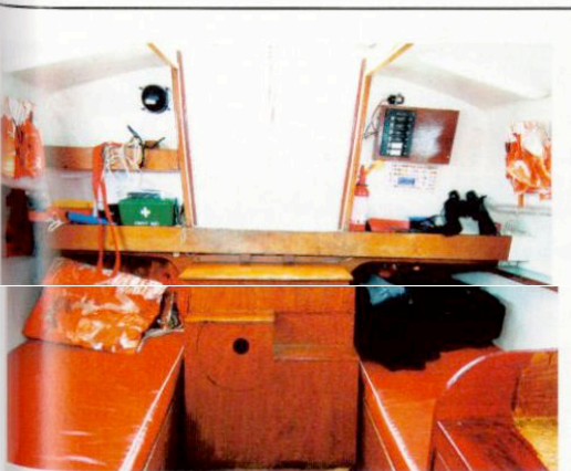
ABOVE Now that the original Stuart Turner 5hp petrol inboard has been removed, the space behind the companionway steps is used for stowage

Noggin was then powered by a 4hp two-stroke outboard until Alun switched it for the long-shaft four-stroke Yamaha with remote controls