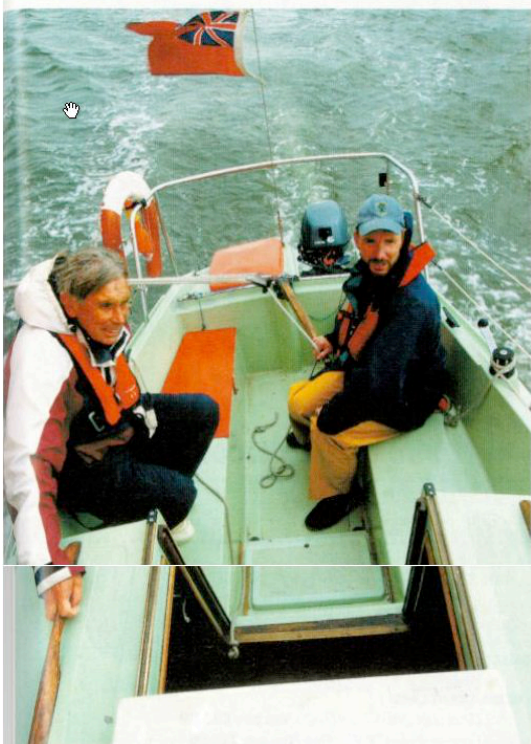
▲ The outboard fits in the transom well and hinges up under sail – here we're motor-sailing

out the engine itself and took off the prop, leaving the shaft in place. Economy of removal being a priority, he left the exhaust outlet in the transom too, simply cutting off and bunging up the pipe on the inside.